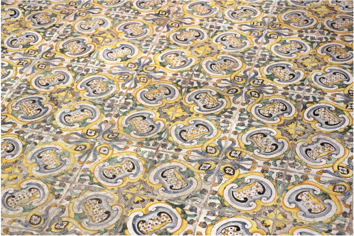
Fig. 7 Ligurian manufacture, Tiles on the floor of the Galleria delle Stagioni , 18 th century, polychrome maiolica