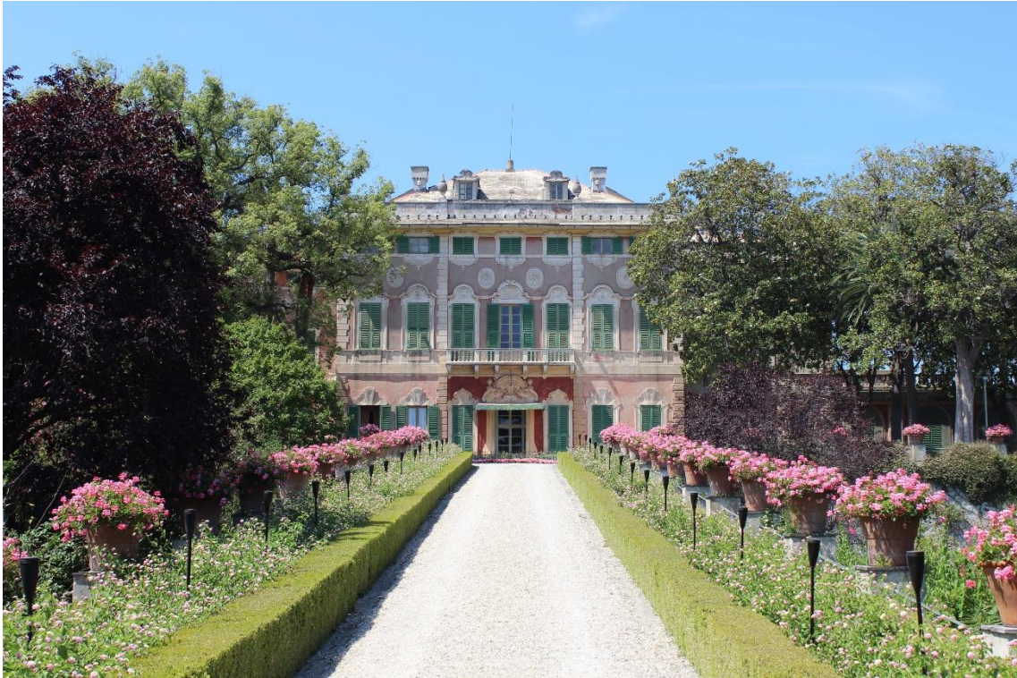
Fig. 2 Villa Durazzo Faraggiana di Albissola Marina , 18 th century