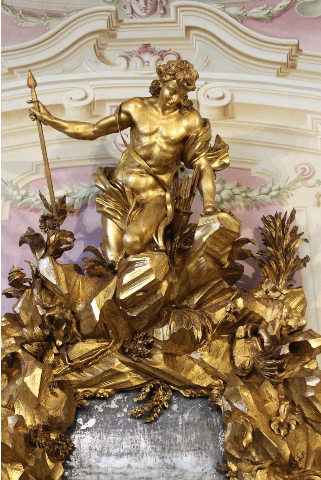
Fig. 6 Filippo Parodi, Mirror with the myth of Narcissus (Detail)