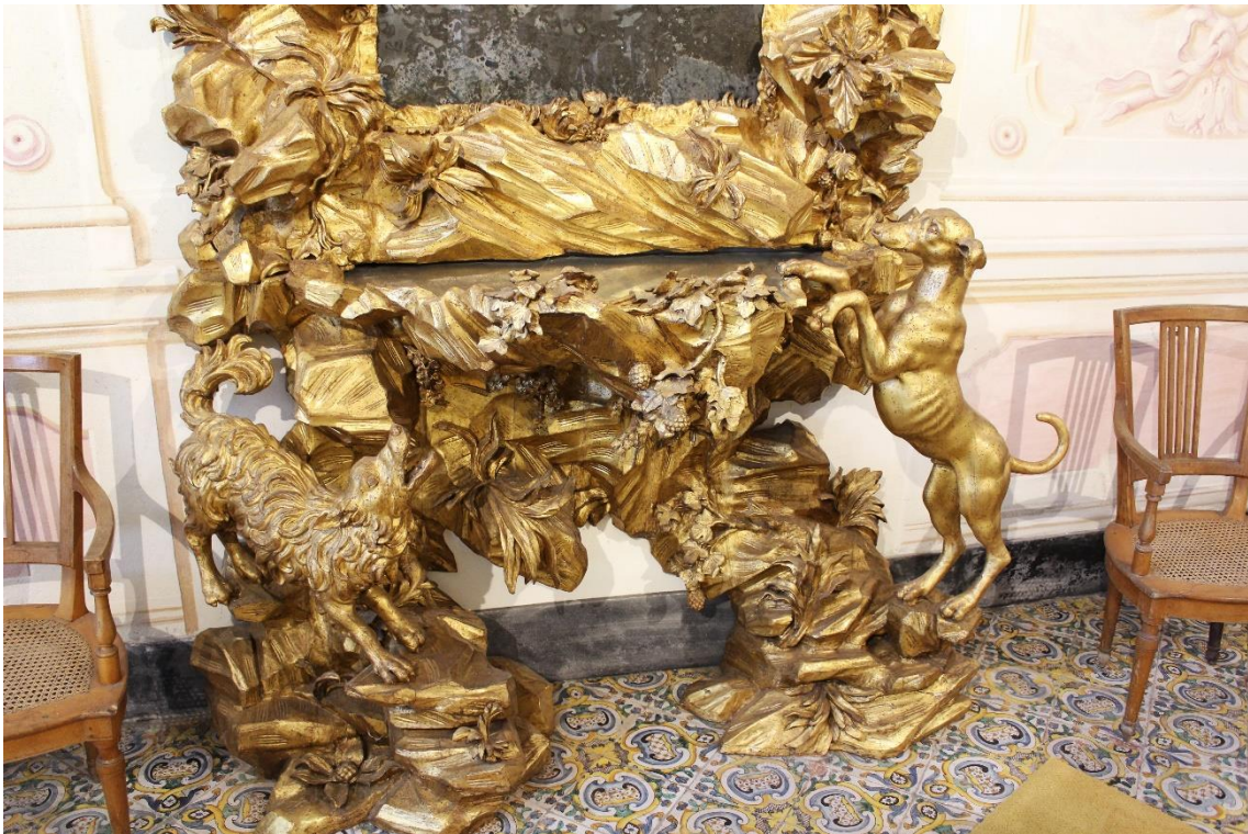
Fig. 5 Filippo Parodi, Mirror with the myth of Narcissus (Detail)