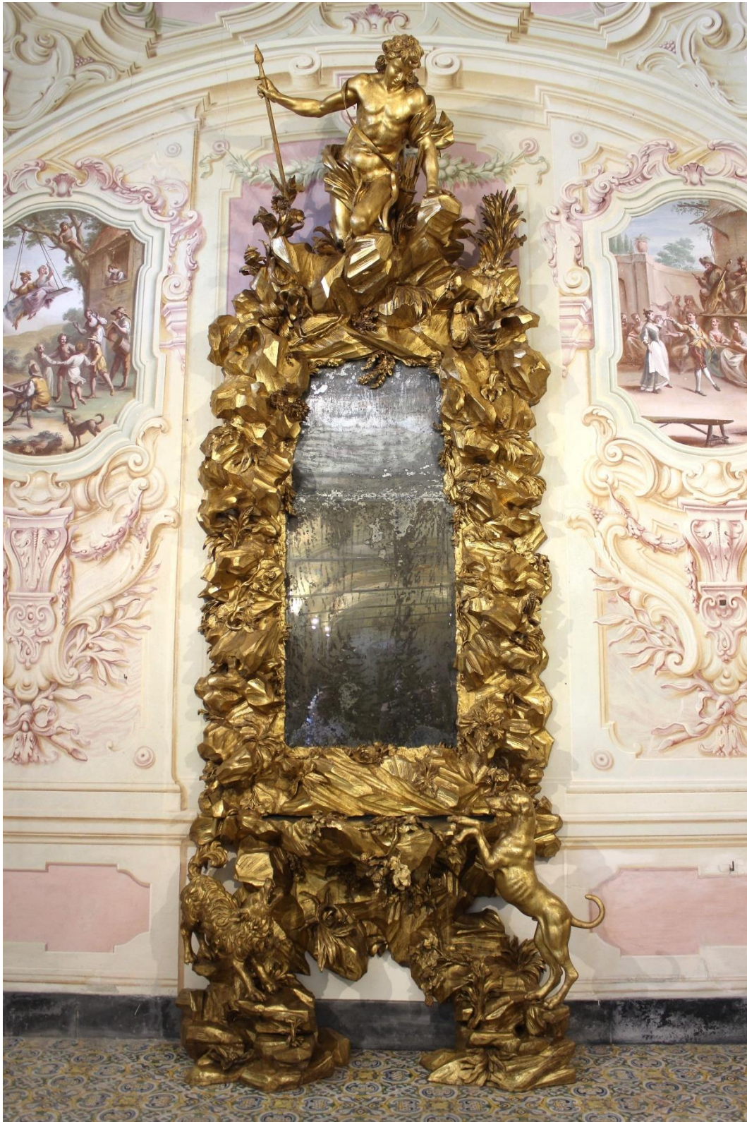
Fig. 1 Filippo Parodi, Mirror with the myth of Narcissus , 17 th century, wood with golden colour, 450 x 170 x 70 cm