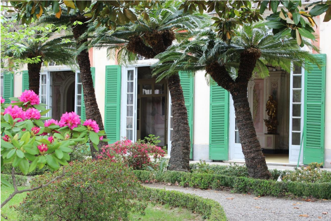
Fig. 4 Garden of the Villa with the Galleria delle Stagioni