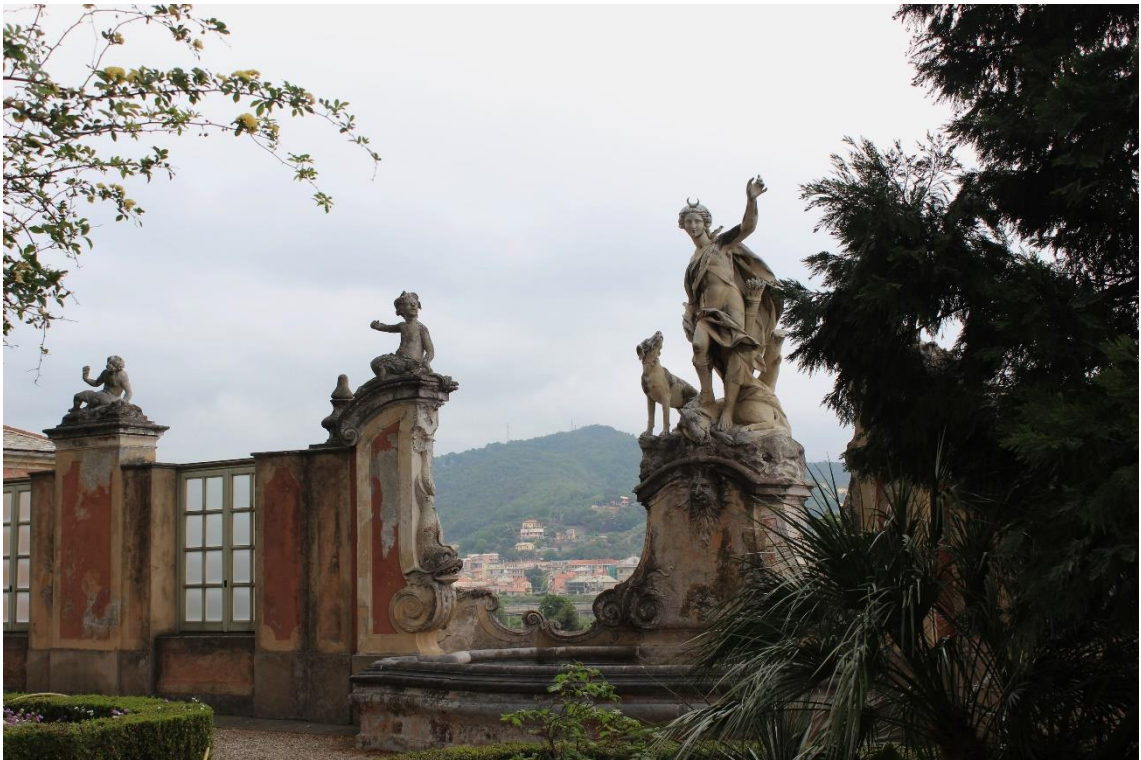
Fig. 8 Unknown Ligurian sculptor, Fountain with the sculpture of Diana , 2 nd half of the 18 th century, marble and stucco, garden of the Villa Durazzo Faraggiana di Albissola Marina