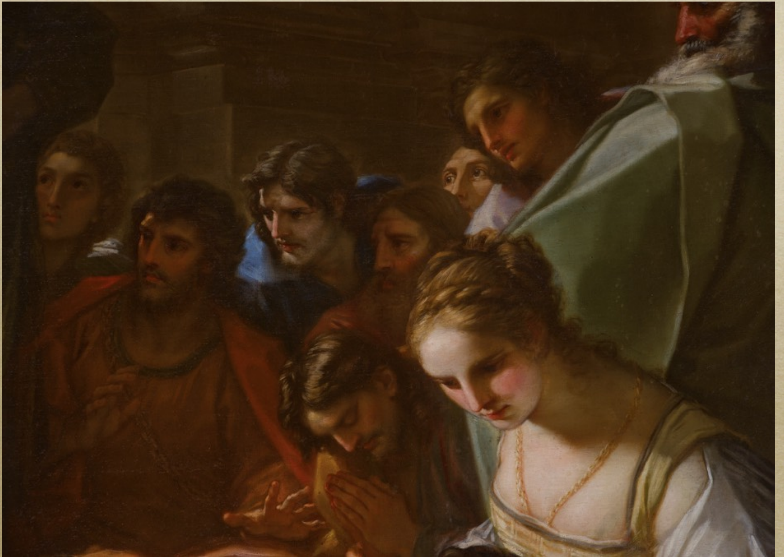
FIG. 11: B. Luti, The Investiture of St. Ranieri , 1703-12, Pisa, Duomo (detail)