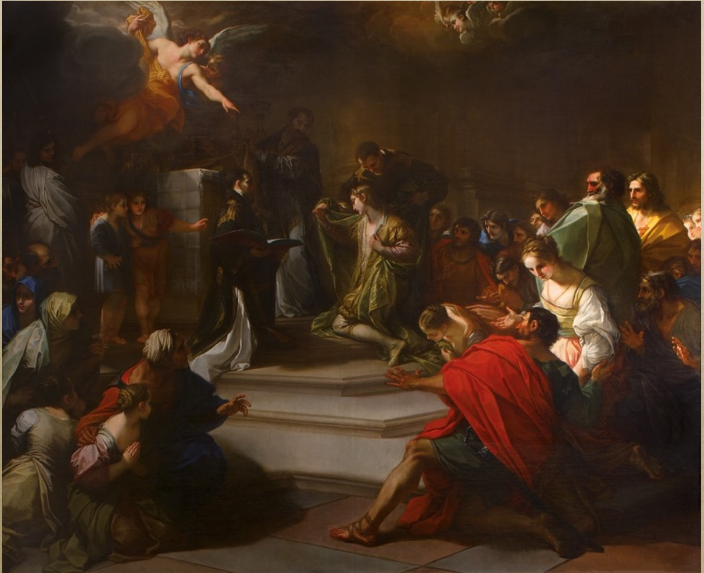
FIG. 7: B. Luti, The Investiture of St. Ranieri , 1703-12, Pisa, Duomo