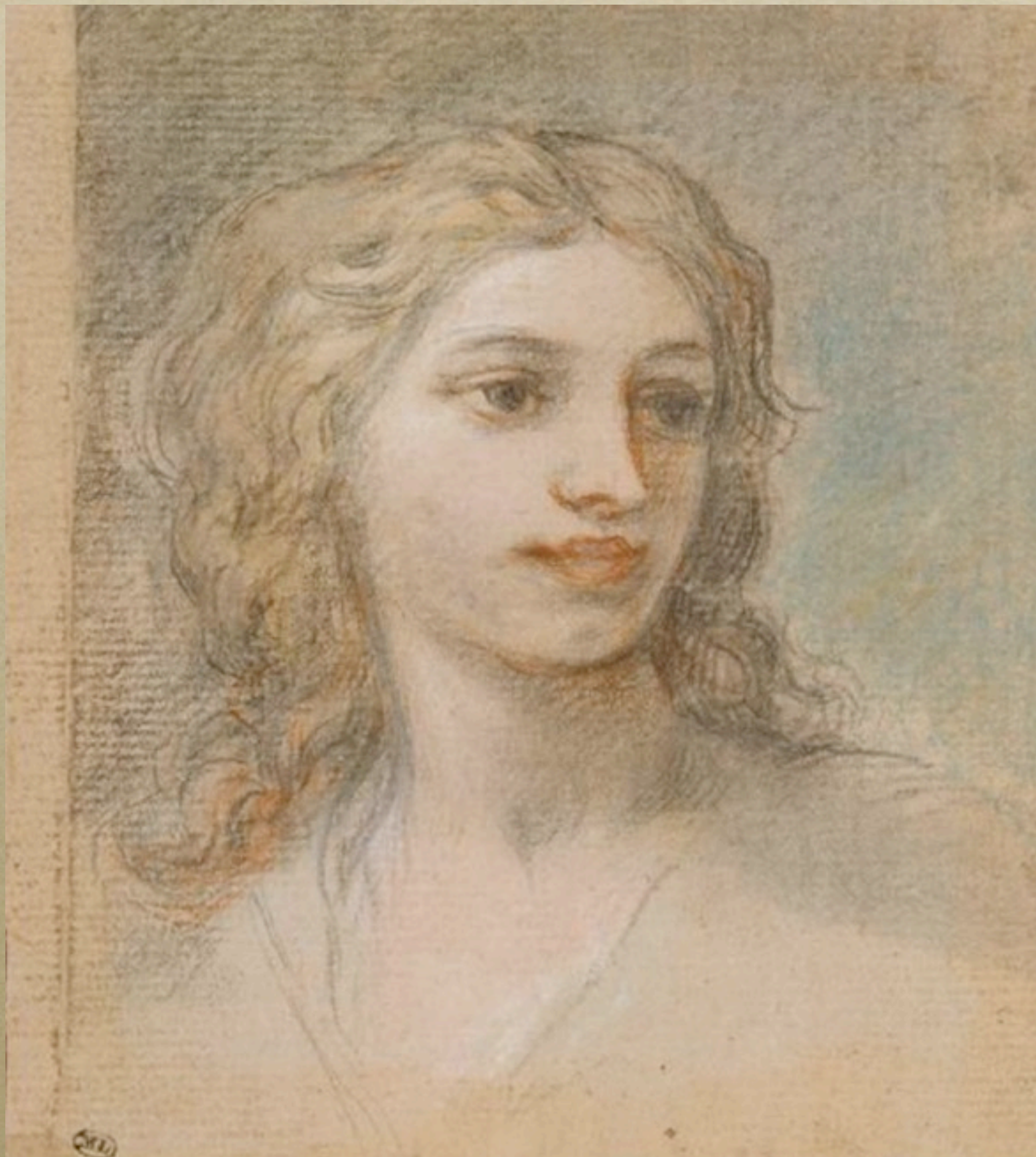
FIG. 3: Volterrano, Study of a Female Head , c. 1650, Paris, Musée du Louvre, Département des Arts Graphiques, inv. 1174 r