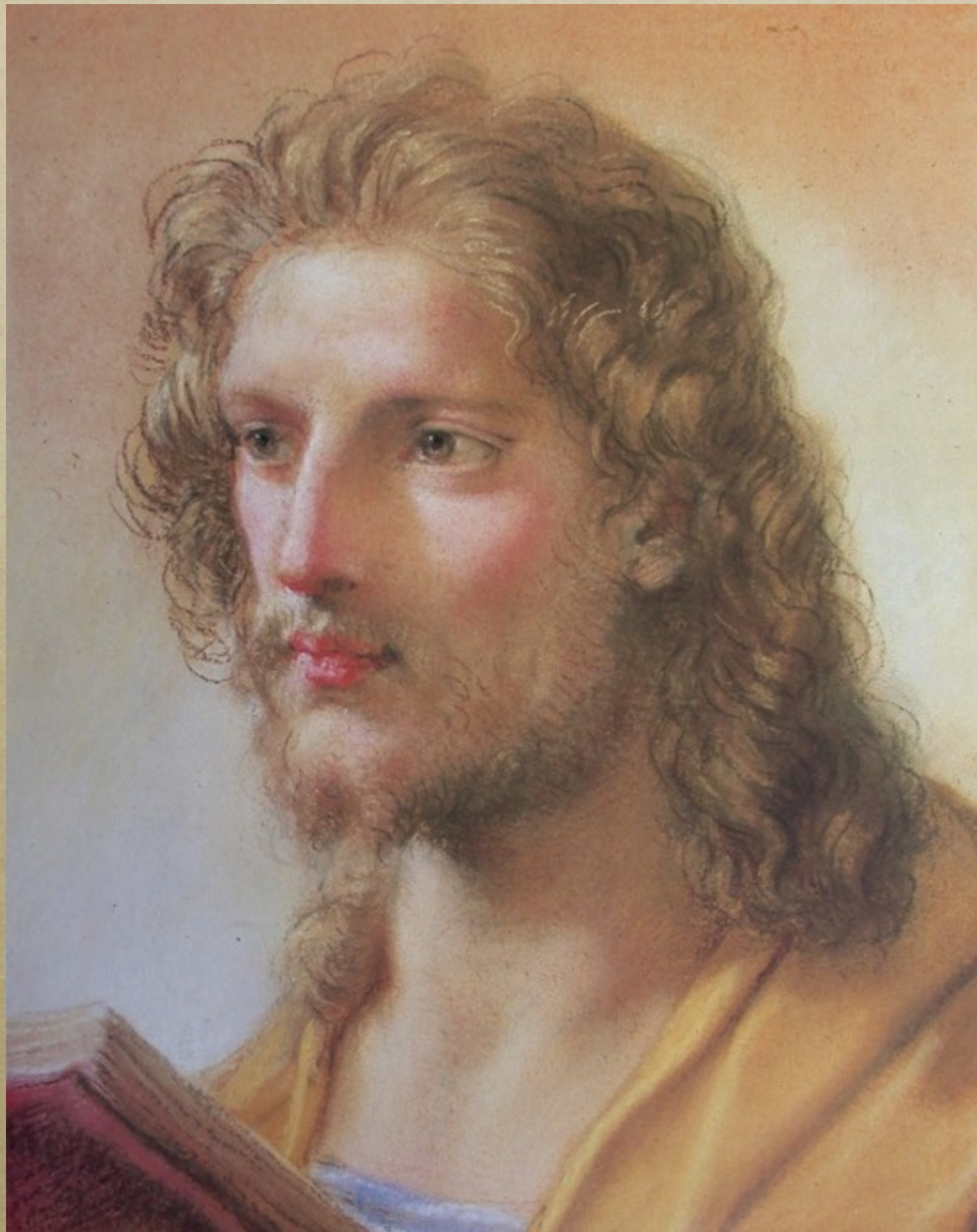
FIG. 9: B. Luti, Man with a Book (Apostle ?) , 1712, Lawrence, University of Kansas, Spencer Museum of Art