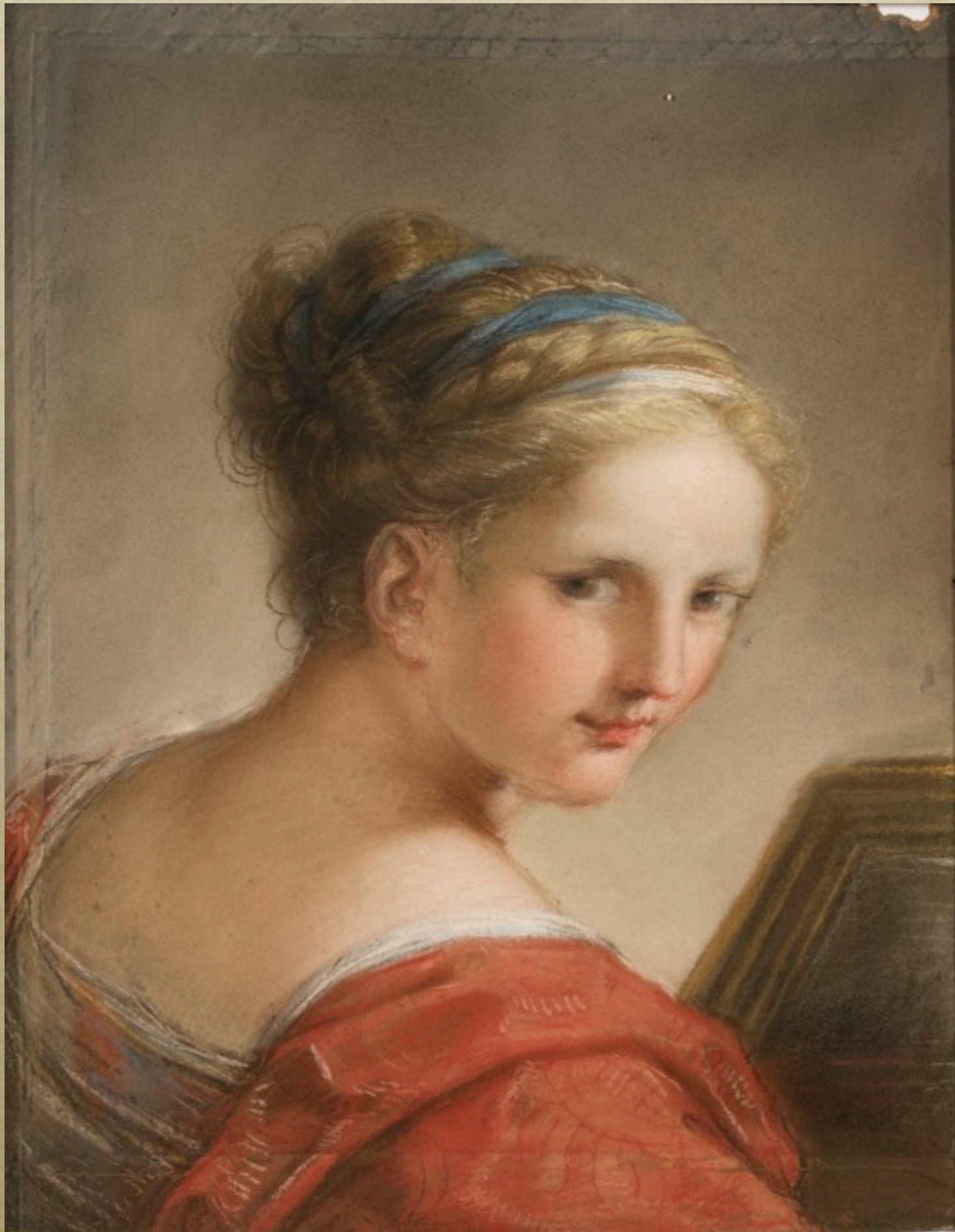
FIG. 6: B. Luti, Girl in Red , c. 1704, Roma, Galleria Nazionale di Palazzo Corsini, inv. 579