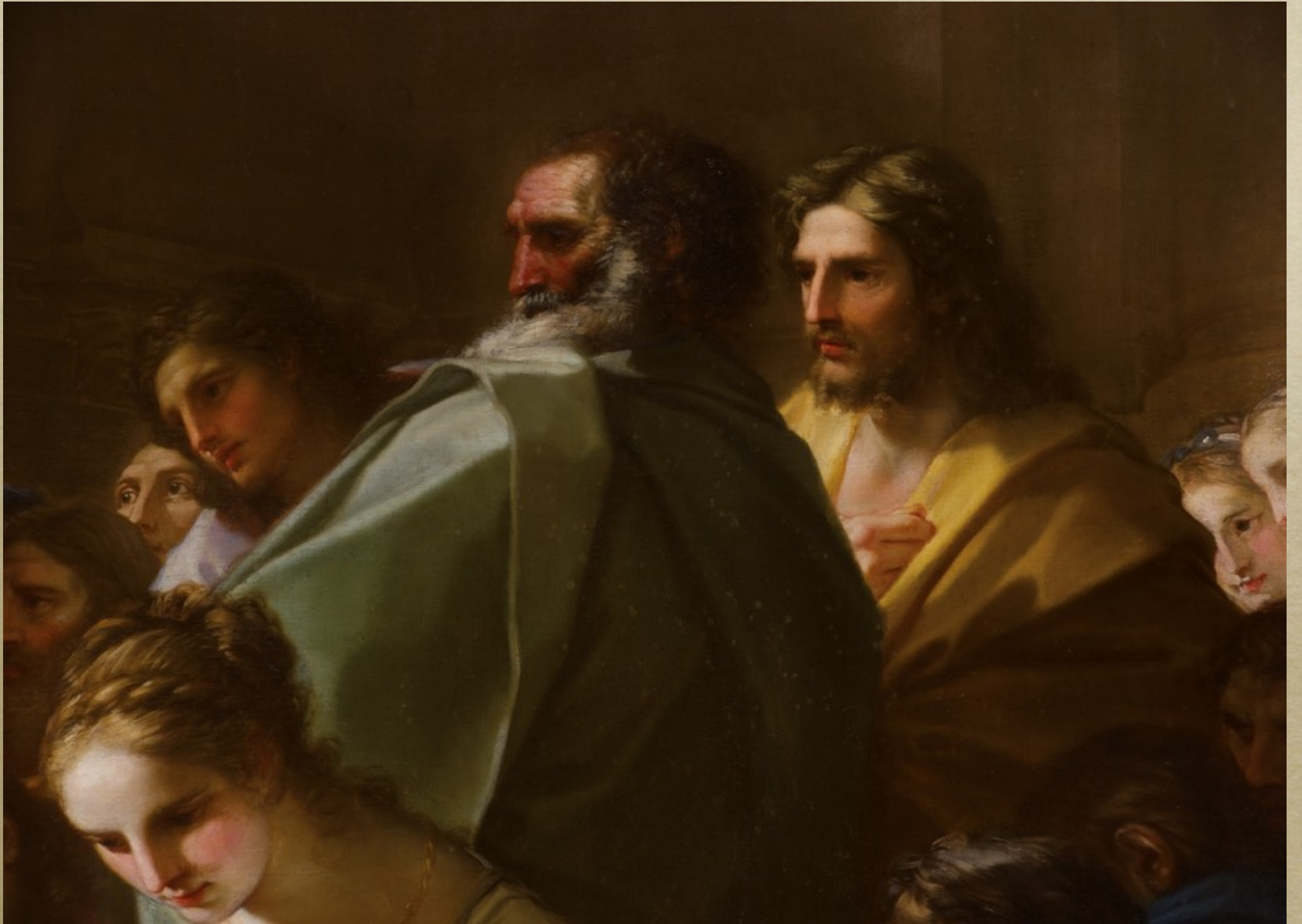
FIG. 8: B. Luti, The Investiture of St. Ranieri , 1703-12, Pisa, Duomo (detail)