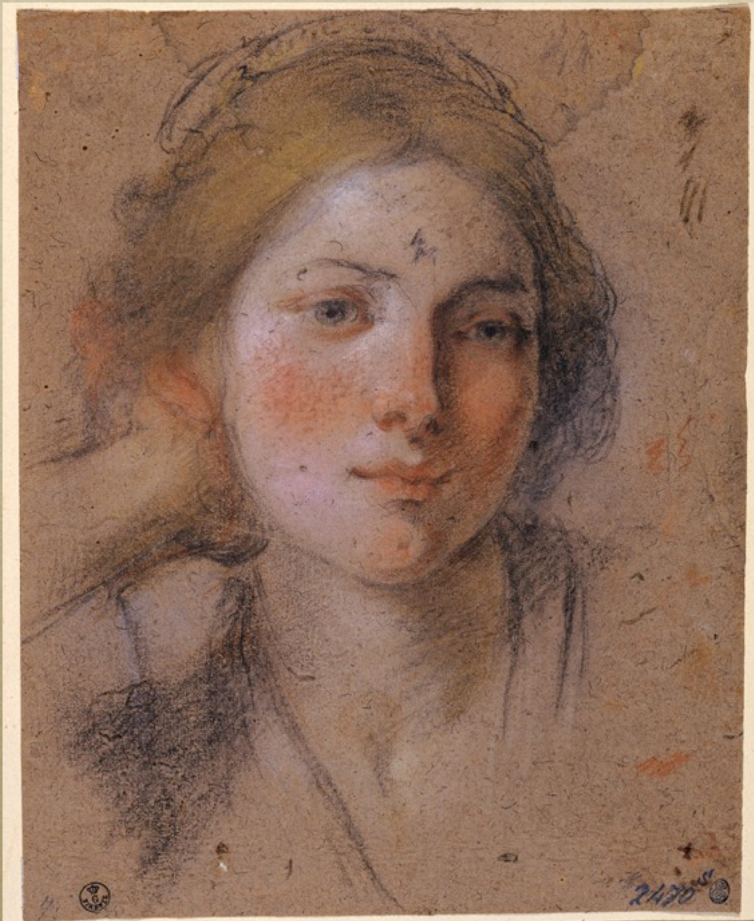
FIG. 2: F. Furini, Study of a Female Head , 1640, Firenze, Gallerie degli Uffizi, Gabinetto Disegni e Stampe, inv. 2470 S