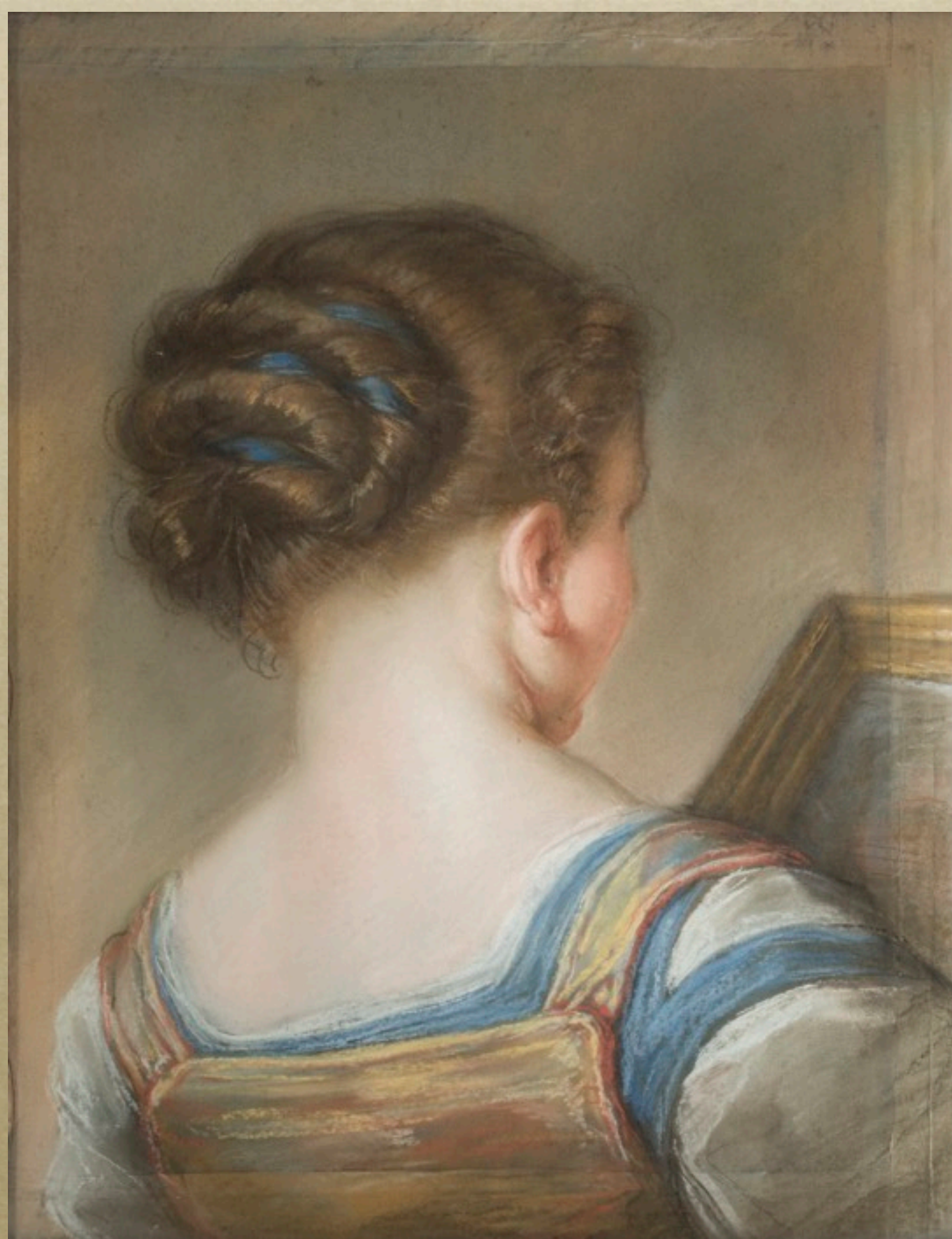
FIG. 5: B. Luti, Head of a Young Girl seen from the back , c. 1704, Roma, Galleria Nazionale di Palazzo Corsini, inv. 575