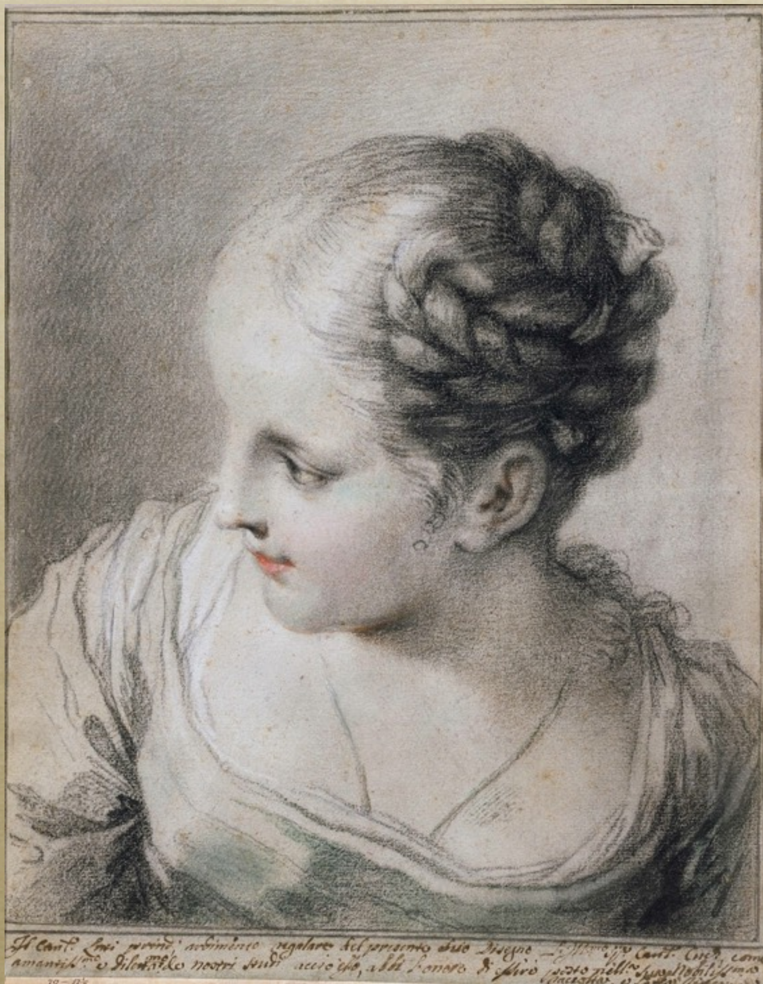
FIG. 4: B. Luti, Half-Bust of a Girl , c. 1716, Holkham Hall, Norfolk