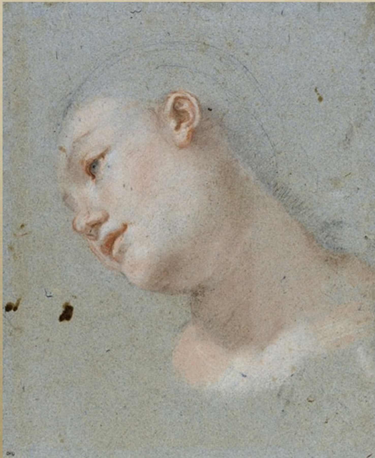
FIG. 1: F. Curradi, Study of a Female Head , 1616-17, Paris, Musée du Louvre, Département des Arts Graphiques, inv. 2905 r