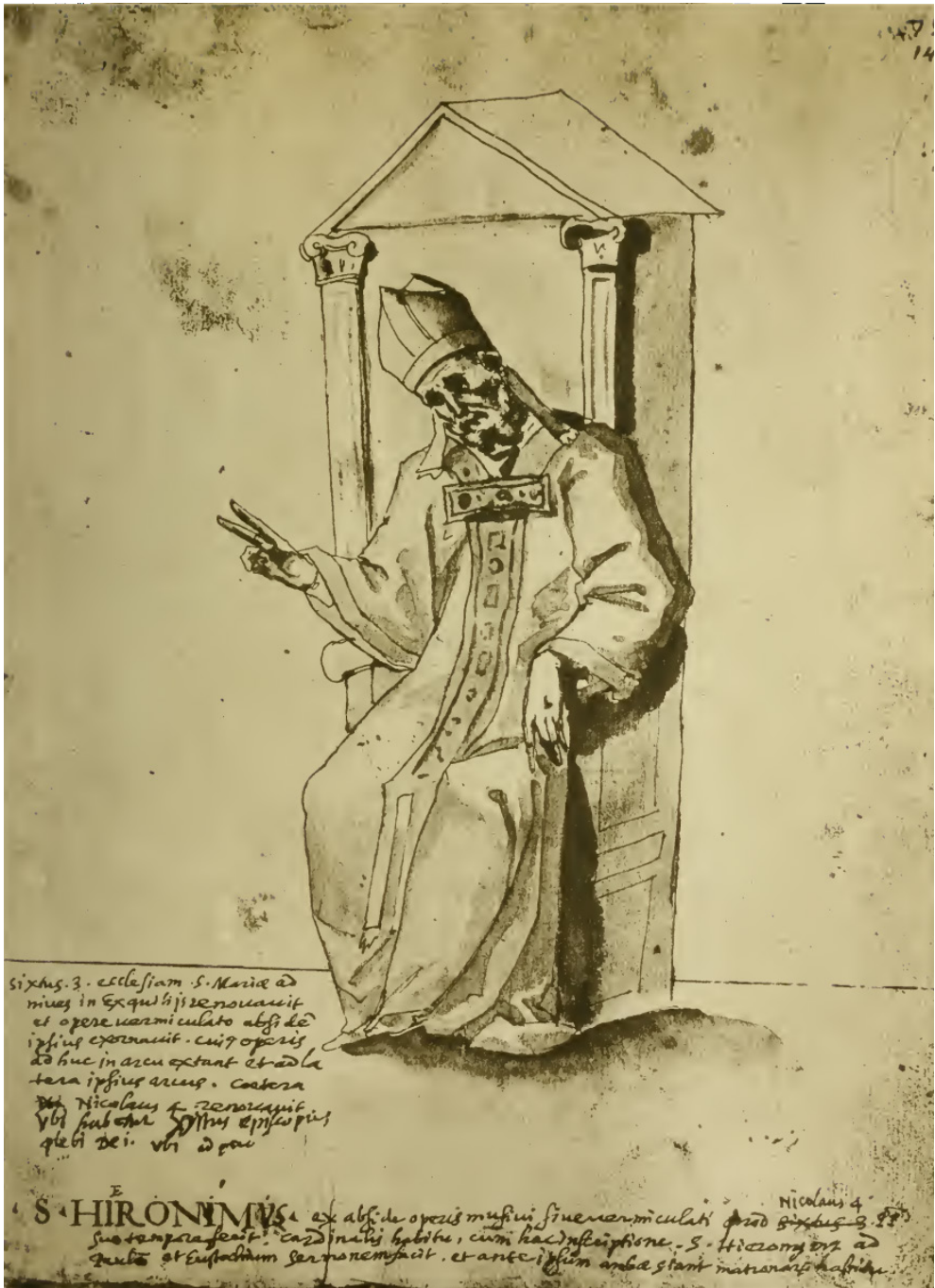
Fig. 5. Reproduction of the apsidal mosaic representing Saint Jerome, 1295, Codex Vaticano Latino 5074