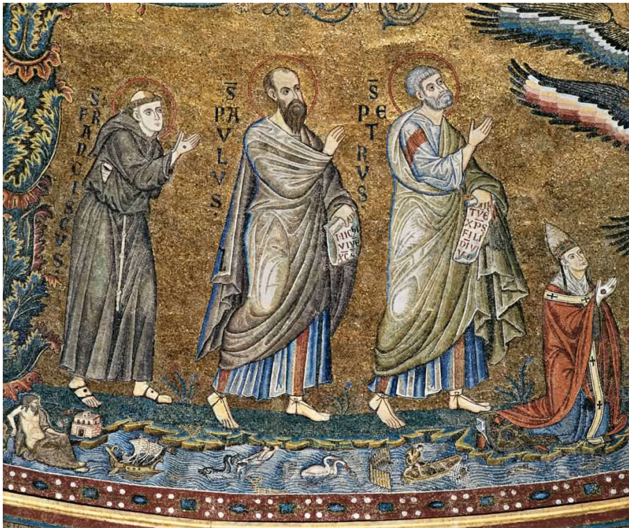
Fig. 3. Jacopo Torriti, Apse mosaic, Saint Francis (detail), 1269, Rome, Santa Maria Maggiore