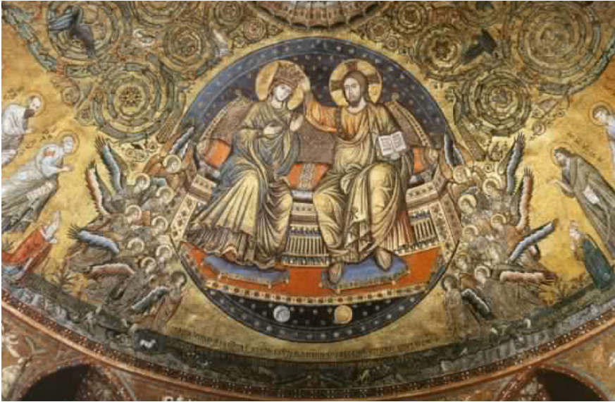
Fig. 2. Jacopo Torriti, Apse mosaic , 1296, Rome, Santa Maria Maggiore