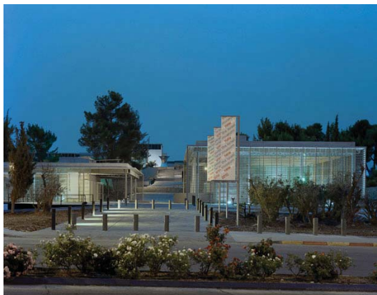
Fig. 2. View of the Museum

In the summer of 2010, the Israel Museum completed the most comprehensive upgrade of its 20-acre campus in its history, featuring new galleries, entrance facilities, and public spaces. Most important were the consideration of the public's flow throughout the galleries and the cohesive narrative of the exhibits. The museum's collections of fine art, archaeology, and Jewish art and life now come together to present the history of world culture from nearly one million years ago to the present day.