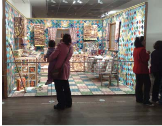
Fig. 4. The Youth Wing – in the exhibition

The Youth Wing's staff includes some 80 teachers, instructors, lecturers, and administrators, who share a common vision: to serve as a center for study and creation, which stimulates artistic and cultural dialogue and endeavor, inspired by the original works housed in the Israel Museum.