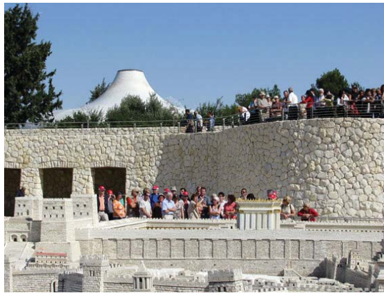
Fig. 8. The Model of Jerusalem from the Second Temple Period

scale model, covering nearly one acre, evokes ancient Jerusalem at its peak, meticulously recreating its topography and architectural character in 66 CE, the year in which the Great Revolt against the Romans broke out, leading to the destruction of the Temple and the city in the year 70 CE. Online visitors may take a virtual tour of the model and examine the details of the tiny buildings; King Herod's Temple, The Basilica, Antonia Fortress, Tomb of Alexander Jannaeus, Theater and the Palace of Caiaphas, the High Priest with the online zoom tool ( http://www.imj.org.il/panavision/jerusalem_model_index.html ).