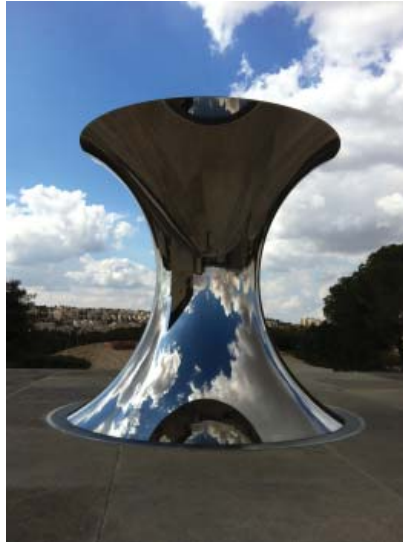
Fig. 1. Anish Kapoor's Turning The World Upside Down, Jerusalem (2010)

This chapter will present the museum as viewed through its electronic footprint - its bi-lingual website. The electronic delivery of the museum not only reflects the sense of the scope and quality of its collections including: fine art, archaeology, and Jewish art and life; presenting the history of world culture from nearly one million years ago to the present day, but also the many events, and cultural and educational activities that go on in the museum campus throughout the year.