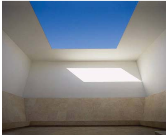
Fig. 3. Space that Sees, James Turrell

arching upward and supported by high walls made of rough fieldstone. As in a Japanese Zen garden, the ground is covered in gravel, and paths lined with local plants and trees connect the different sections. A multitude of materials were incorporated into the garden's design: stones of different kinds and sizes, exposed concrete, and water. Walls enclose smaller spaces and rectilinear terraces of the garden, and echo the shapes of the Museum's buildings. Combined with an Oriental landscape and an ancient Jerusalem hillside, the garden serves as the backdrop for the Israel Museum's display of the evolution of the modern western sculptural tradition. On view are works by modern masters including Jacques Lipchitz, Henry Moore, Claes Oldenburg, Pablo Picasso, Auguste Rodin, and David Smith, together with more recent site-specific commissions by such artists as Magdalena Abakanowicz, Mark Dion, James Turrell, and Micha Ullman.