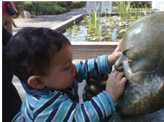
Fig. 5. Discovering art

The Ruth Youth Wing for Art Education, unique in its size and scope of activities, presents a wide range of programming to more than 100,000 schoolchildren each year, and features exhibition galleries, art studios, classrooms, a library of illustrated children's books, and a recycling room. Special programs foster intercultural understanding between Arab and Jewish students and reach out to the wide spectrum of Israel's communities.