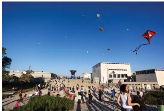
Fig. 9. Kite Festival in the Art Garden

With so much going on in the galleries; curator's talks, guided tours and school tours, and so much taking place in the Education Wing; art classes, lectures and year-long courses there is never a dull moment. In addition there is always plenty going on in and around the campus, especially during the summer; open air concerts in the Art Garden, family art happenings, and our annual Kite festival. All this has to be entered into the museum online calendar and all events and activities re posted online and sent out to thousands of friends and visitors over monthly electronic updates. The Israel Museum is an exciting place, and whether you have come to glimpse the once in a lifetime, 2,000 year of Dead Sea Scrolls, are wandering around the galleries with a friend from out of town or simply hanging out in the Art Garden with the family, one thing is for sure – you will never be bored!