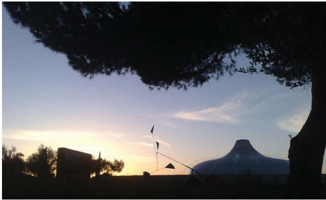
Fig. 6. The Shrine of the Book

Among the architectural highlights of the Museum's original campus is the Shrine of the Book the galleries that house the Dead Sea Scrolls, as well as rare early medieval biblical manuscripts. These are perhaps the museum's most famous collections – the oldest Biblical manuscripts in the world. The ancient texts represent a journey through time, which, adopting a scholarly-historical approach, traces the evolution of the Book of Books. Dating from the third century BCE to the first century CE, the Dead Sea Scrolls were discovered between 1947 and 1956 in eleven caves on the northwestern shores of the Dead Sea. The manuscripts are generally attributed to an isolated Jewish sect, referred to in the scrolls as “the Community,” who settled in Qumran in the Judean desert.